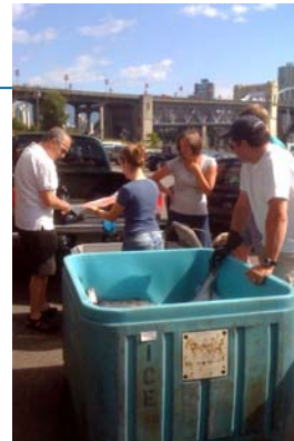
CSF members picking up their shares, summer 2009