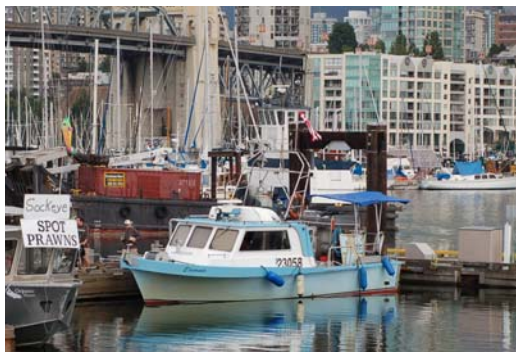
Eldorado moored at False Creek Fisherman's Wharf

By investing a sum at the start of the season, customers guarantee that we have enough money to operate our fishing business for the season. In exchange, customers receive a bounty of wild, fresh, northern salmon.